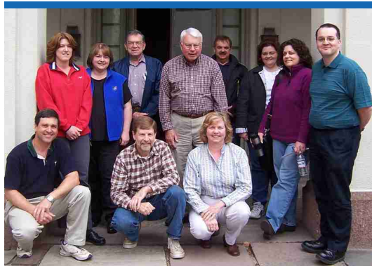
Leadership Strategic Planning 2006-2007